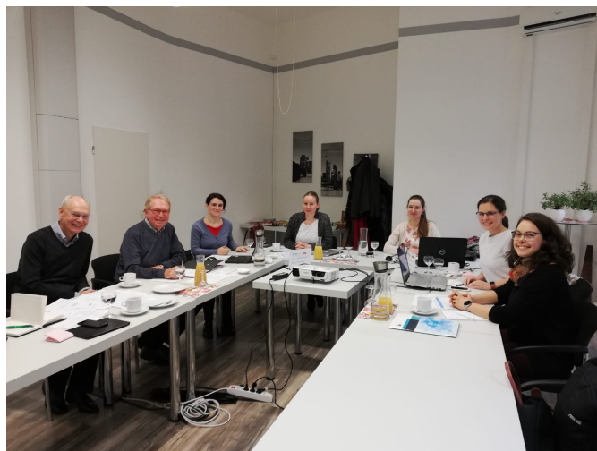
Participants at the meeting